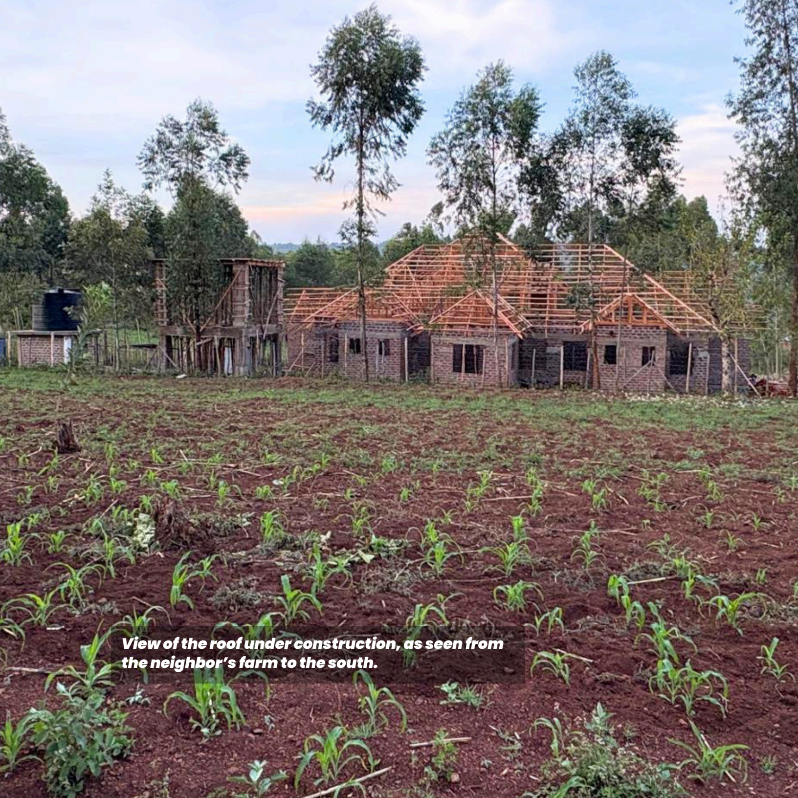
View of the roof under construction, as seen from the neighbor's farm to the south.

With Walls Complete, the Roof Now Takes Shape