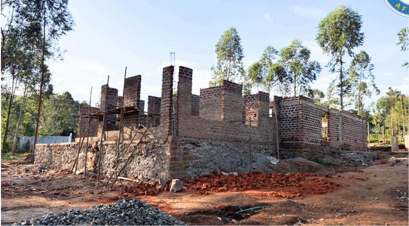
Above: View of the new walls for the boardroom on the northwest corner of the structure. The property slants downward so much that the foundation had to be built up significantly to keep the Lodge level.