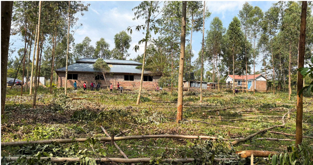
The previous barn structure with the water tower and caretaker's house to the right.

Although it is not YET finished, Trinity Lodge is already taking shape. The name “Trinity Lodge” is specifically to honor the community of Trinity Lutheran Church, Cottage Grove, where we hosted our very first fundraiser and raised large part of the funds to drill the water well. Just as that community has faithfully sustained Angels of Africa over the years, so we hope that Trinity Lodge can sustain and support volunteers, guests, the Board, and the organization for years to come!