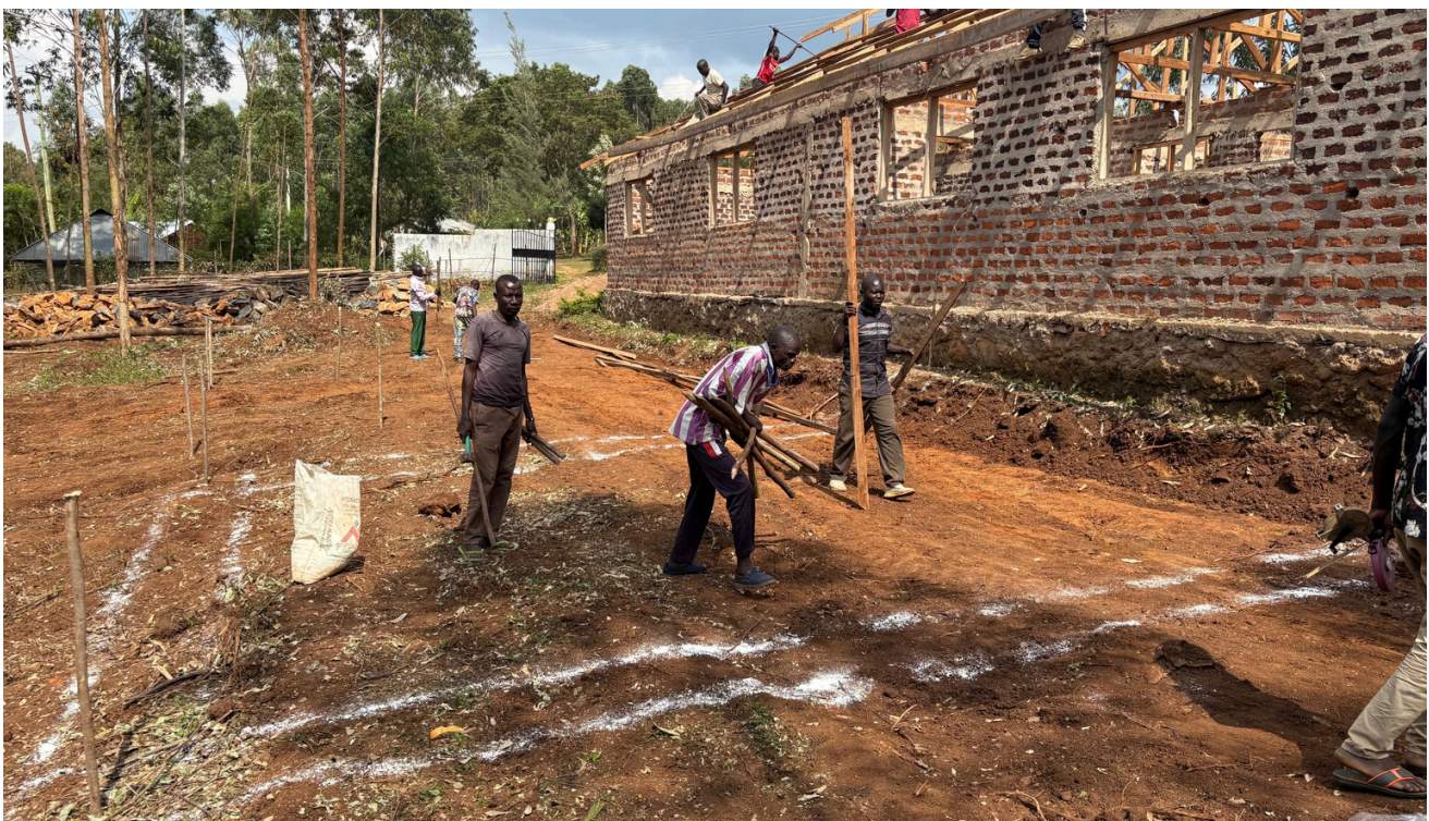
Below: Workers demarcate the expansion for the boardroom on the front of the barn.