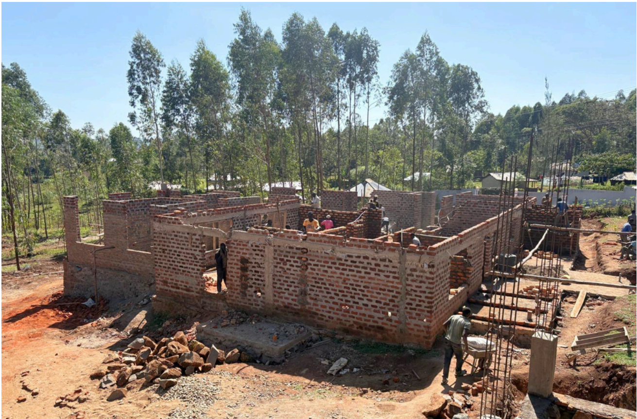
Below: View of the new walls taking shape, as seen from the water tower.